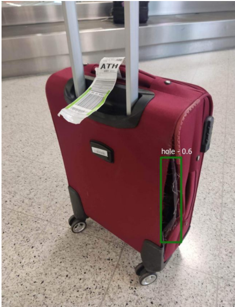
Figure 1: Damage detection boxes on a damaged bag.