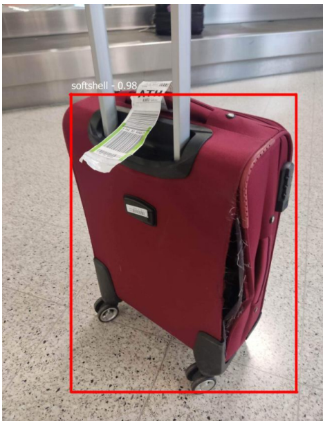
Figure 2: Softshell detection box on a damaged softshell bag.